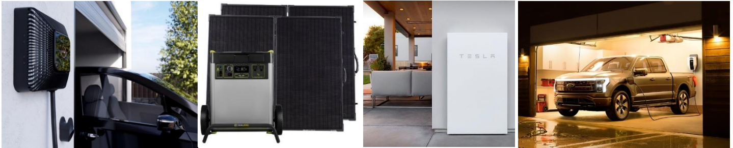
Vehicle to Home Charger by Wallbox Goal Zero Battery and Solar Kit Tesla Power Wall Ford F-150 Lighting (2022)

Resilience comes in many forms that can provide power when the main grid is down: vehicle to grid charging allows electric vehicle owners power their homes with their car’s batteries, lower cost strategies (Goal Zero) provide portable power with solar included for recharging, and stationary batteries built into your home’s electrical system.