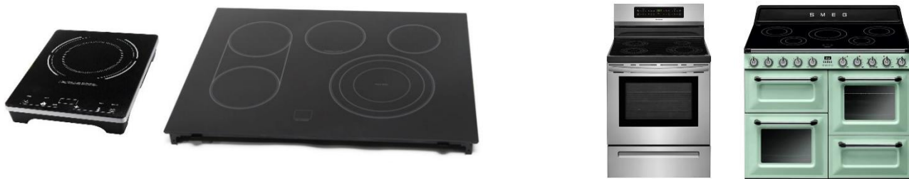
Counter-top and Drop in Induction Cooktops $40 - $4,000

Induction cooking provides safer cooking, more precise temperature control and is preferred by professional and home chefs. In addition, it's healthier: burning gas in the home releases pollutants, such as nitrogen dioxide, cancer-causing formaldehyde and acetaldehyde, and ultra-fine particulates (Singer 2018) and has been linked to asthma in adults (Jarvis et. al. 1996) and children (Weiwei et. al. 2013).